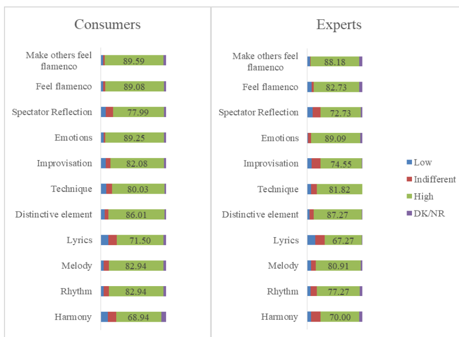
Figure 3. Valuation of the elements of the flamenco song. The authors' sources.

As stated before, different legal frameworks focus on copyright protecting the author. However these results lead to the discussion whether in case consumers and experts value the performer's contributions to the flamenco song so highly, should not copyright also protect the performer? And what would it take for it to be applicable? The proposal of this paper is to use joint works, supported by the concept of global protection of the song and other legal texts in Europe and North America. In Spain, the content of TRLPI's article 132 should be reinforced standardising the legal treatment without changing the status of any of the performer in the creation process of the song.