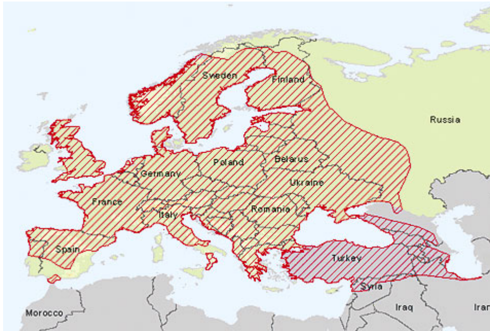
Fig. 1. Distribution of roe deer in Europe (striped area).

activities, and ecological value as part of European biodiversity (Andersen et al., 1998). However, overabundant roe deer populations may cause serious damage to forest plantations and agricultural crops, may be involved in road traffic accidents and spread of diseases. As a consequence of density dependent regulation, at very high densities they can seriously compromise their own welfare (Speyside Deer Management Group, 2007).